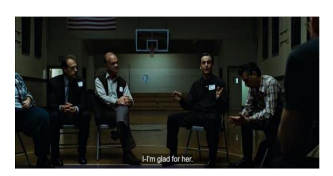
Patient A: "I'm glad for her, because she deserves..." (00:07:04-00:07:06)

Love and affection are intense feelings of affection for friends, neighbors, and family (Linda, 1997: 50). People have their own challenges to deal with; life is not simple. The following exchange illustrates how God always shows human beings love and affection: