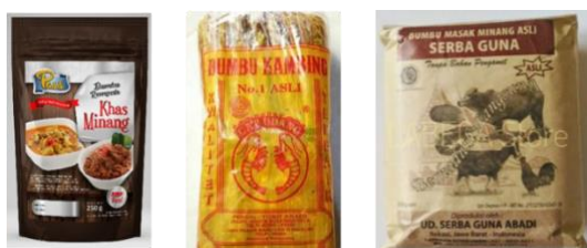
Figure 5. New Packaging Design of PASS Bumbu Serbaguna Compared to Competitors

in 250 g and it will use transparent-metalized standing pouch. This packaging is more convenient because it has a zip-lock and it will secure the product from sunlight exposure.