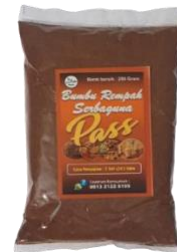
Figure 1. PASS Bumbu Rempah Serbaguna

The company recently has launched new product called PASS Bumbu Rempah Serbaguna, a multi-purpose seasoning for foods as Padang food, middle-east food, mie aceh, soup, curry, etc.